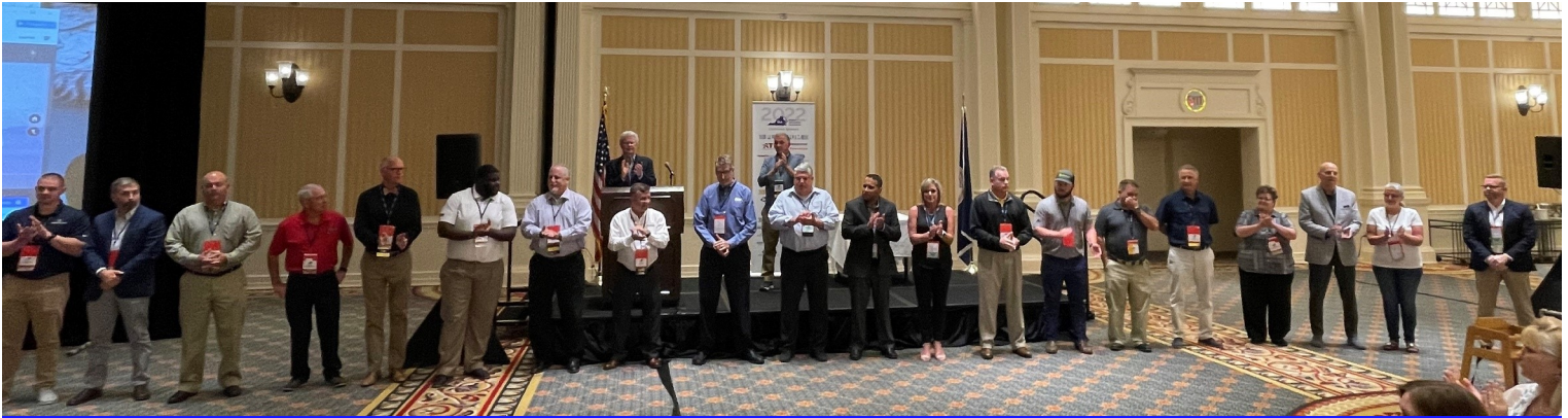
A BIG THANK YOU to our VAA Sponsors who were individually recognized during the Saturday Awards Banquet